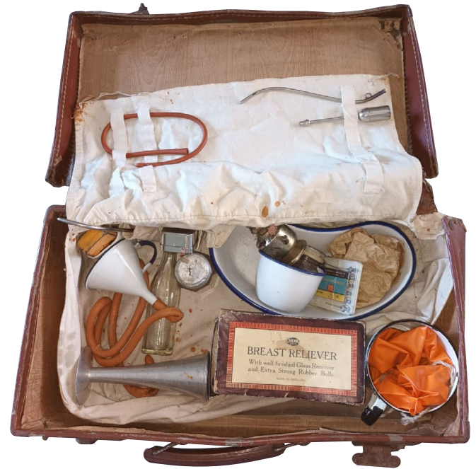
Above: Brigid Glenane's midwifery bag. Instruments include a breast pump, box of syringes and various other medical aids. Left: Brigid Glenane.