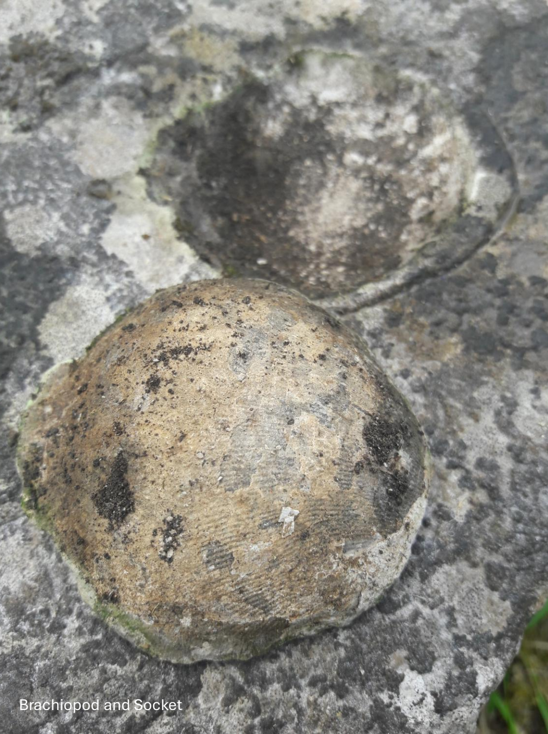
Brachiopod and Socket