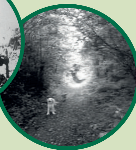
▼ Killarainey Woods, 2016