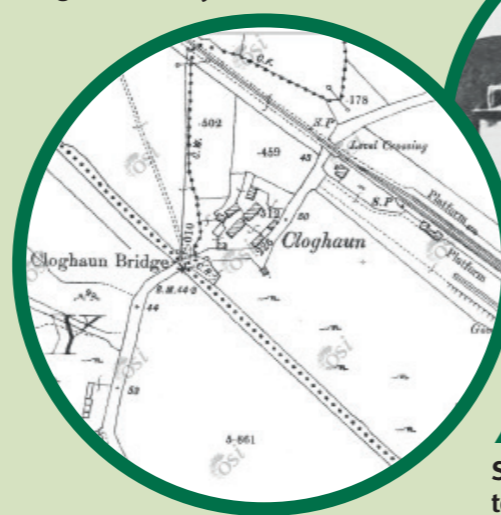
▼ c1900 O.S. historic map of Old Cloghaun Village showing canal (dotted), bridge and railway station

Old Cloghaun Village: The Old Cloghaun village was, in pre-famine times, a small settlement of c. 8 homes within Moycullen townland. In the early 1900's it conveniently lay between the then navigable Moycullen canal and the former Galway-Clifden railway line and was adjacent to Moycullen Railway Station.