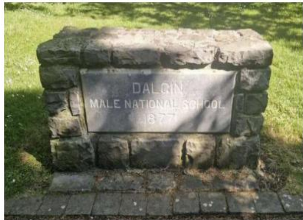
Original Name Plaque