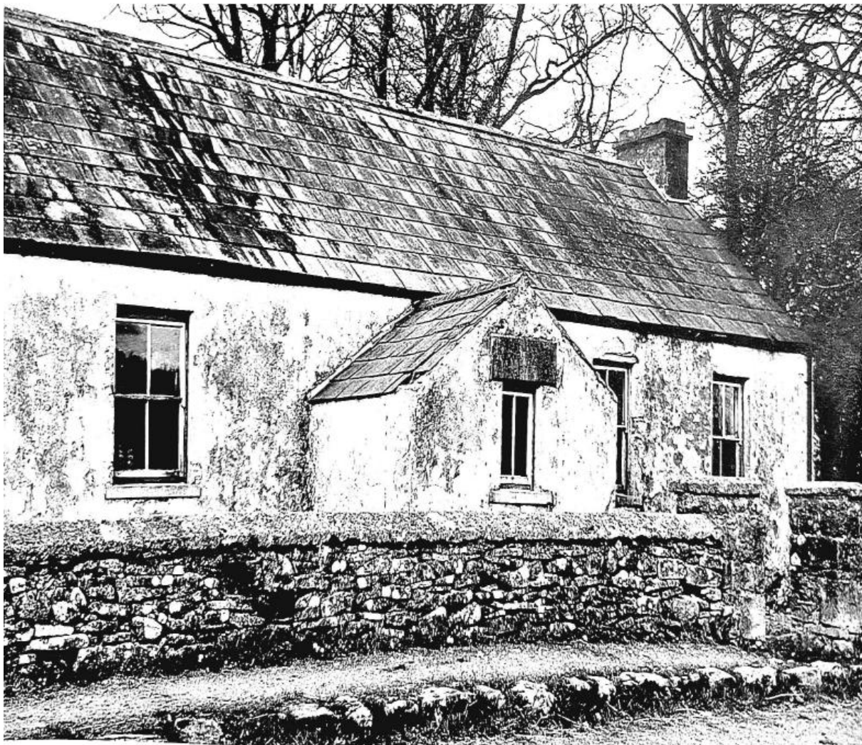
Old Dalgin National School