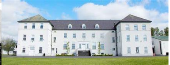
Gortnor Abbey and the much larger school it developed into subsequently

After her graduation with an MB degree in 1948 she went to England where she did her internship.