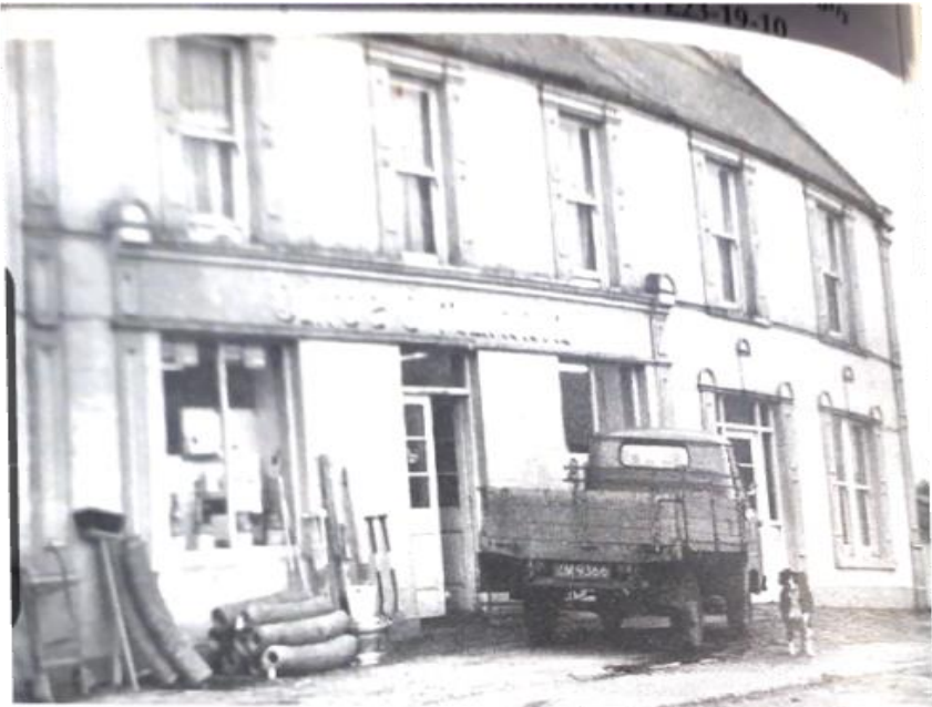
Mannion's Bar and Grocery and Hardware