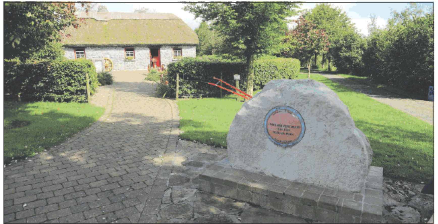
MILLTOWN is a role model community for showcasing its heritage.