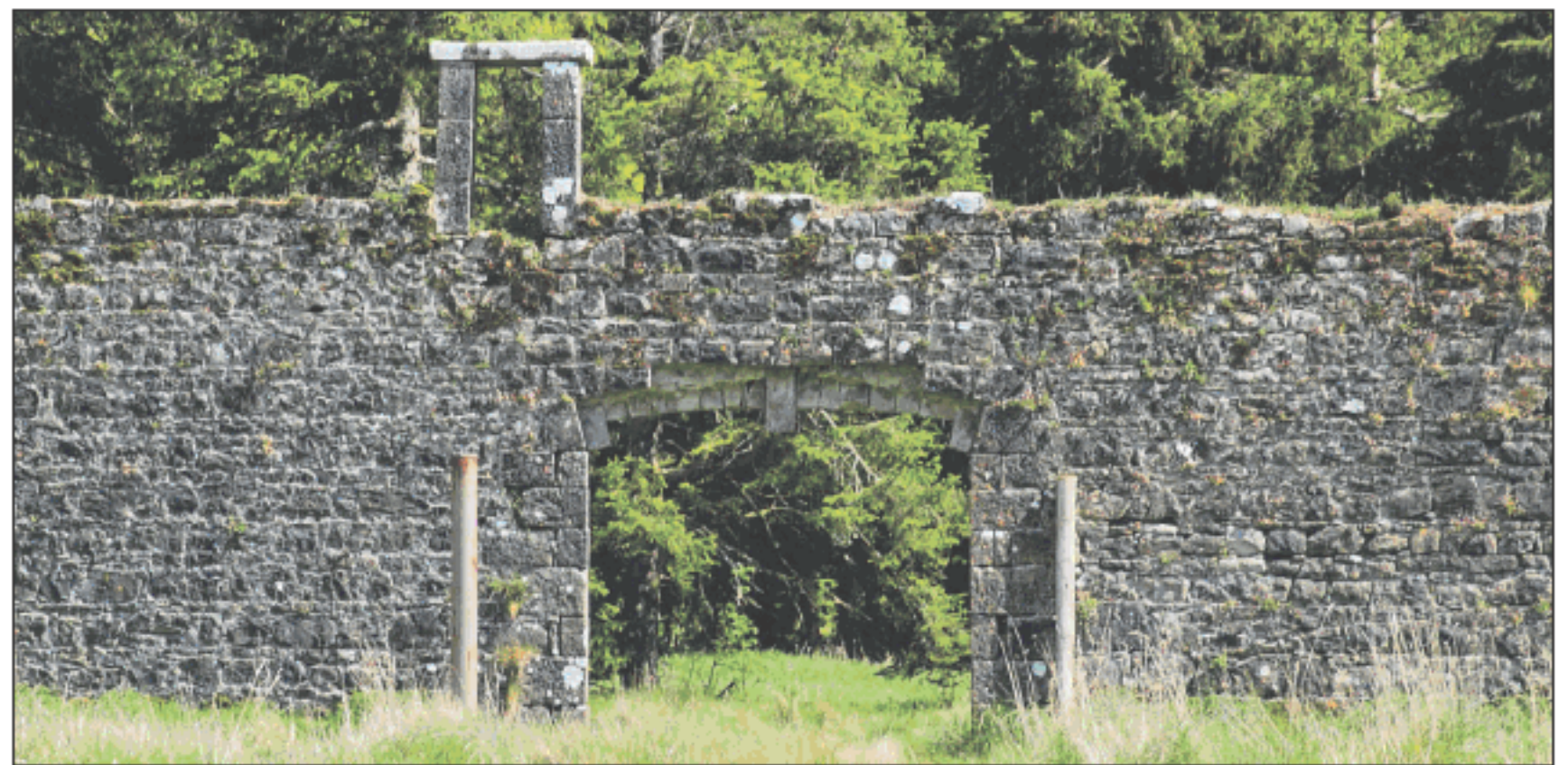
PEOPLE can enjoy a tour of the Walled Gardens in Mountbellew this weekend.

This is a taster of the Digital Story Map of Dunmore which is currently under construction.