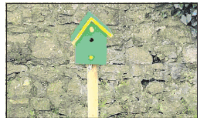
A NEW nesting box at St Jarlath's College.

Finally, the 'Don't be Trashy' group's aim