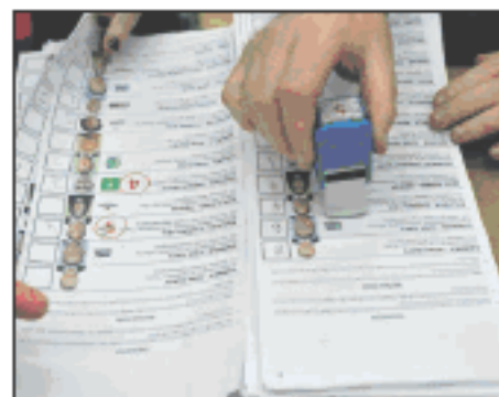
VOTING papers from 2020 - more candidates are likely to be chasing more seats in Galway East if a General Election is held in 2024.

This put him second to Independent Sean Canney, who