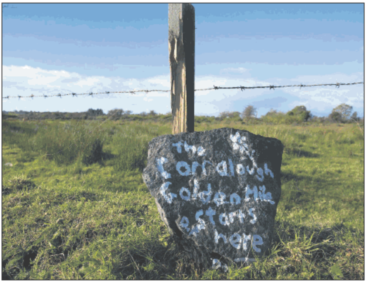
THE Corralough Golden Mile starts here.