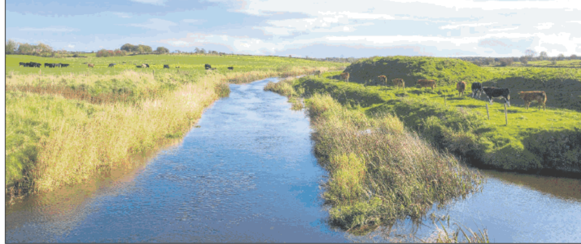
A TRANQUIL river scene on the Milltown Golden Mile.