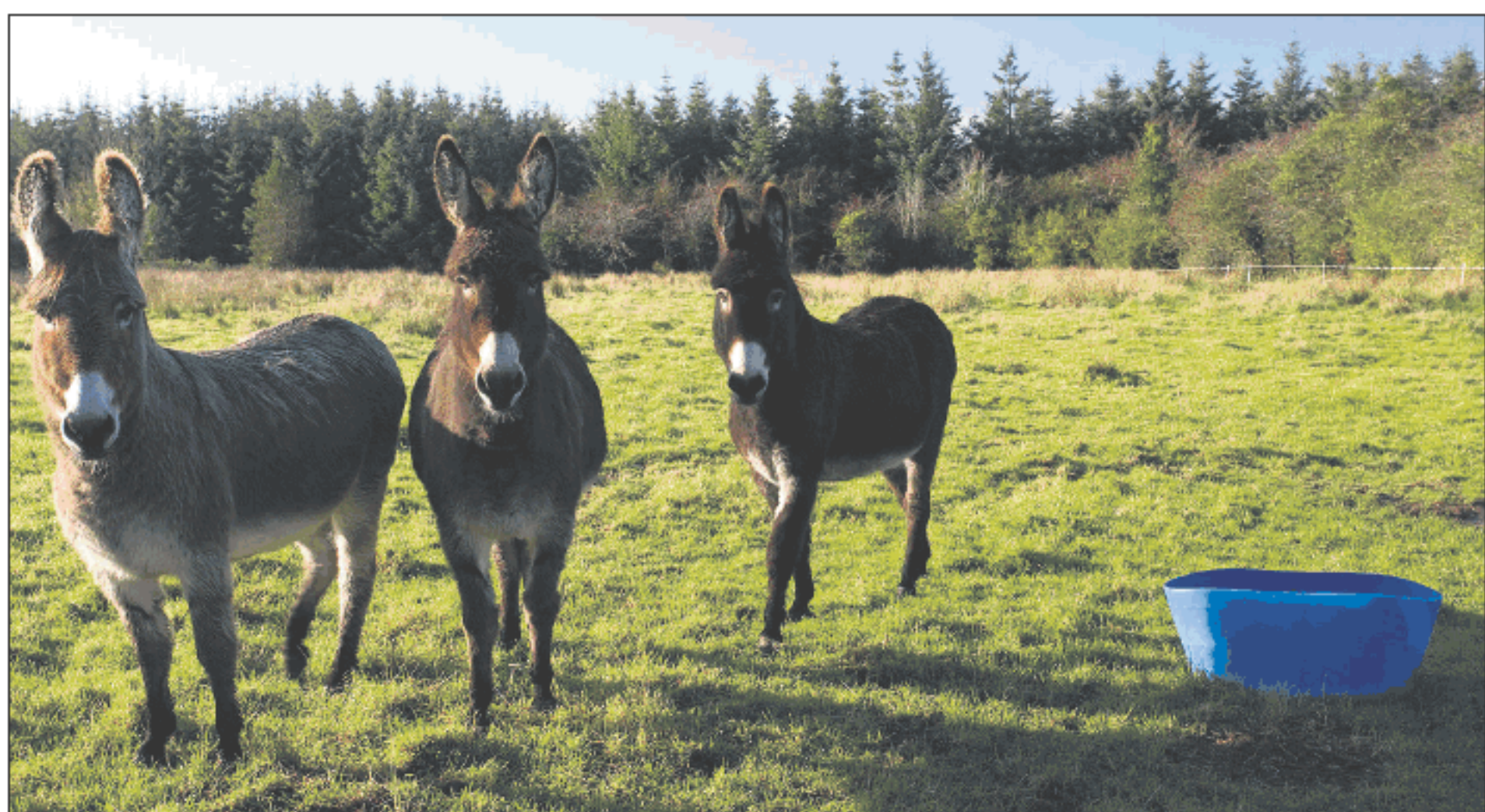
THREE curious donkeys on the Newbridge Golden Mile.

and organisations which entered the competition. They came from all parts of the county, from Aughrim, Maree (Oranmore), Milltown, Clostoken (Loughrea), Williamstown, Newbridge and Camus in Connemara. While the overall Golden Mile award went to Camus, the award for Community Effort and Litter Management went to the Corrolough Golden Mile Committee, Williamstown. Walkers on this mile are welcomed and directed by a series of hand painted signs on slate and shale rocks. The walk is known locally as Nuala na Midóige walk. Large earthen banks line the road on either side and these are home to a variety of grasses, yarrow, ladies bedstraw, plantain, vetches, strawberries, brambles, mint, black knapweed, horsetails, honey suckle, daisy, furze and brambles. Shortly after you begin the walk you are treated to a view over Corralough, a small lake which contains a crannog. Willow trees dot the landscape, while clumps of meadowsweet, saw