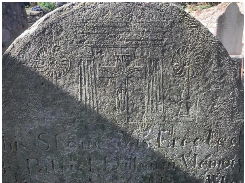
Beautiful engraving on headstone at Old Conna.

During some beautiful Summer evenings the energetic and enthusiastic Medieval Bray Project (MBP) volunteers were clearing out invasive weeds in the church space within the Old Conna Graveyard with a view to possibly reinstating the gravel interior and also gravelling the walkways to allow access to the rest of the cemetery . Weed barrier was laid in preparation for gravel within the church. The entrance pathway has also been cleared, and when COVID permits will be treated in a way similar to the church interior.