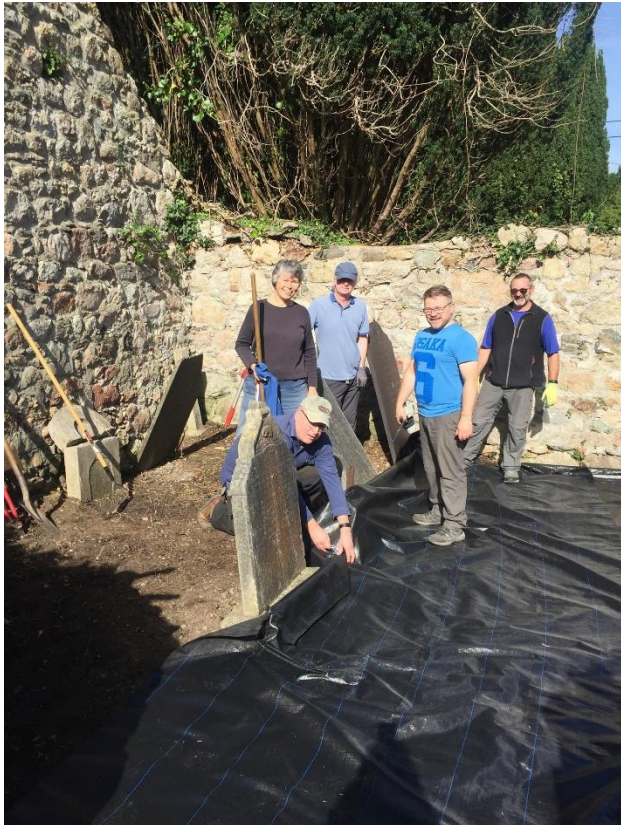
Laying membrane at church interior after week clearance.

It is sincerely hoped that the number of people who have responded to our posts on Facebook stating that they have family members buried in this cemetery will continue to keep an interest in the progress being made and it may be possible through Deansgrange to facilitate a day's access in the future. It is also our intention to involve the pupils from a local school in some artistic representations of selected gravestones.