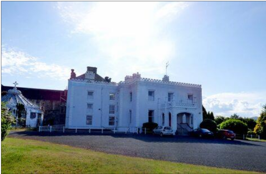
Possible site of the De Dearga Hostel – Loretto convent Bray built on a stoney outcrop – looking over the bay and within sight of local hilltops.