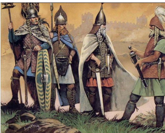
Fictionalised scene of battle during De Dearga times