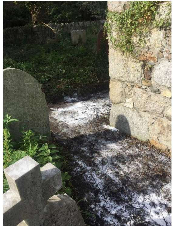
Salted reclaimed pathway at Old Conna Church.

Wicklow Heritage link to an article on the graveyard