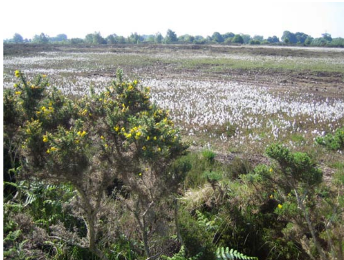
View from bog walk of swathe of bog cotton, with gorse in foreground

The Slieve Bog Natural Heritage Area is a few kilometres east of the town. Bog walks were developed by the Dunmore Tidy Towns group in another area of bogland about half a mile north-west of the town. Three interconnected loop walks were developed and opened in two phases from January 2006 to December 2009. The aim of this project was to provide an accessible and unspoilt nature walk. This popular public natural amenity won Golden Mile awards in 2006 and 2009.