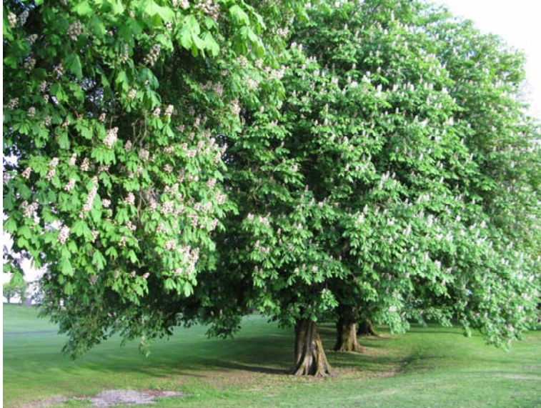
Chestnut trees in Dunmore Demesne Golf Club

Dunmore Demesne Golf Club contains many impressive mature trees including several large chestnut trees. Areas of rough grassland within the Golf Club are great for wildlife. There are also many trees in and around the town, which greatly enhance the town landscape.