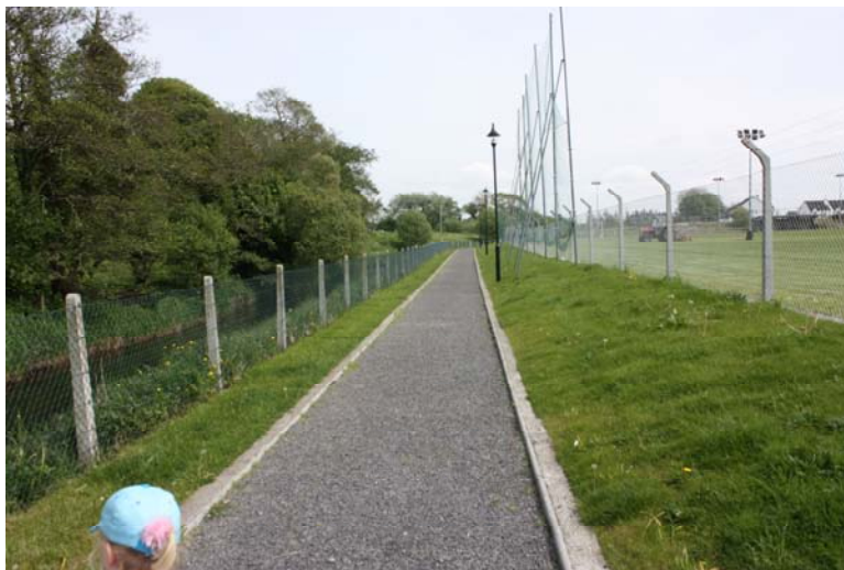
View of river walk along Sinking River, Dunmore

The town of Dunmore has a rich built heritage with the Abbey (founded in 1425) in the centre of town, and Dunmore Castle on the outskirts at Castlefarm. Old stone buildings are often important roosting sites for bats and Daubenton's bat has been recorded in the town environs. This particular type of bat likes to feed along waterways.