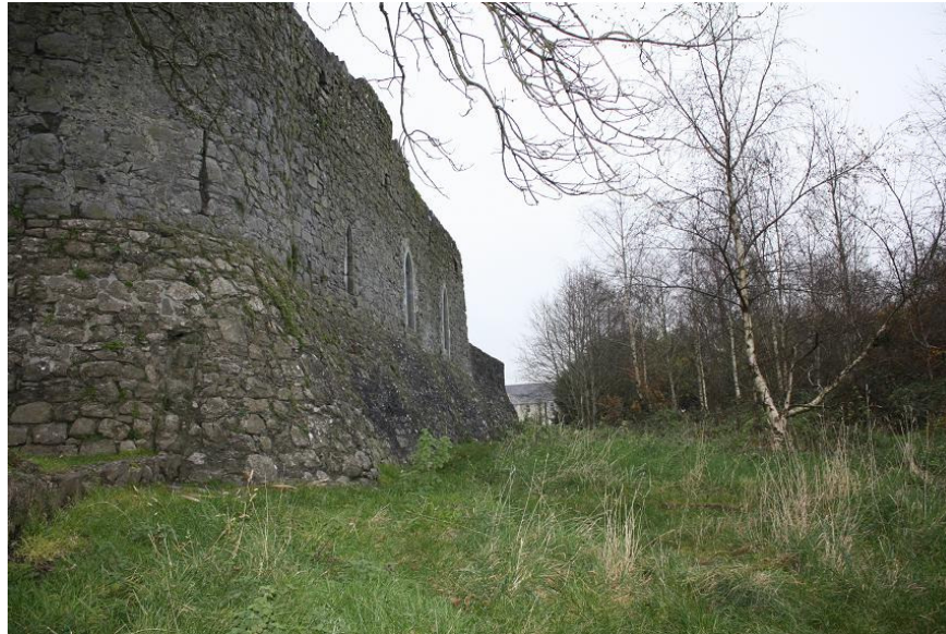
Athenry Castle and wildlife area

This project received grant aid from Galway Rural Development Company Ltd., Rural Development Programme which is financed by the Irish Government under the Rural Development Programme Ireland 2007-2013 and by the European Agricultural Fund for Rural Development: Europe investing in Rural Areas.